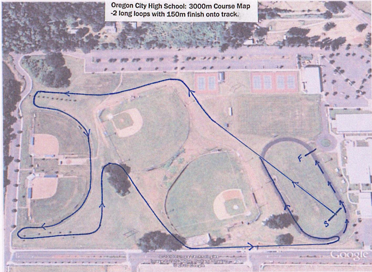
Oregon City High School: 3000m Course Map -2 long loops with 150m finish onto track.